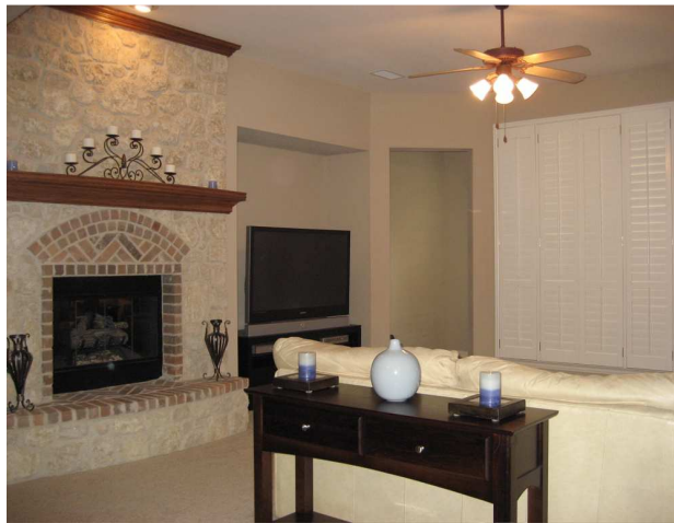
Oversized family room with stone fireplace