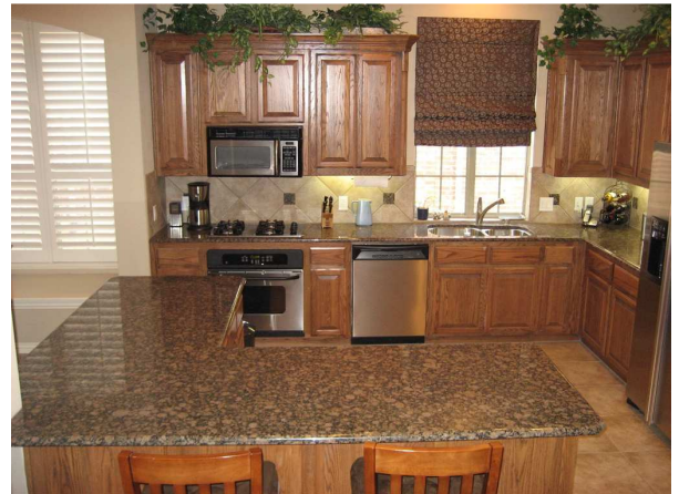
Gourmet kitchen with tons of upgrades