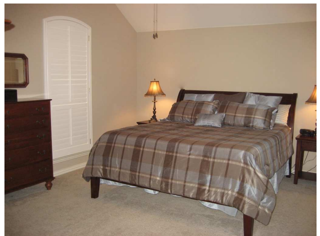
Spacious master bedroom