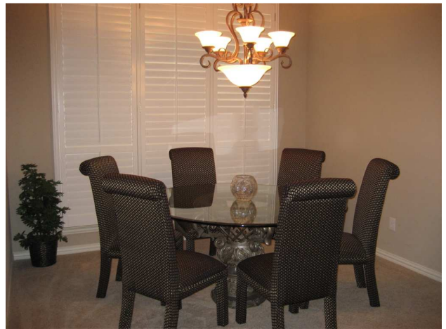
Formal dining room