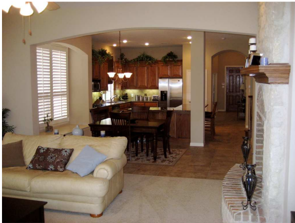
Spacious, open floor plan